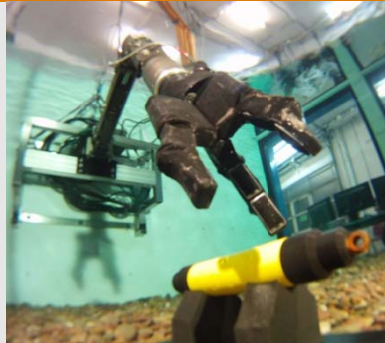
Fig. 2: The Seegrip manipulation system attached to the Orion 7 P