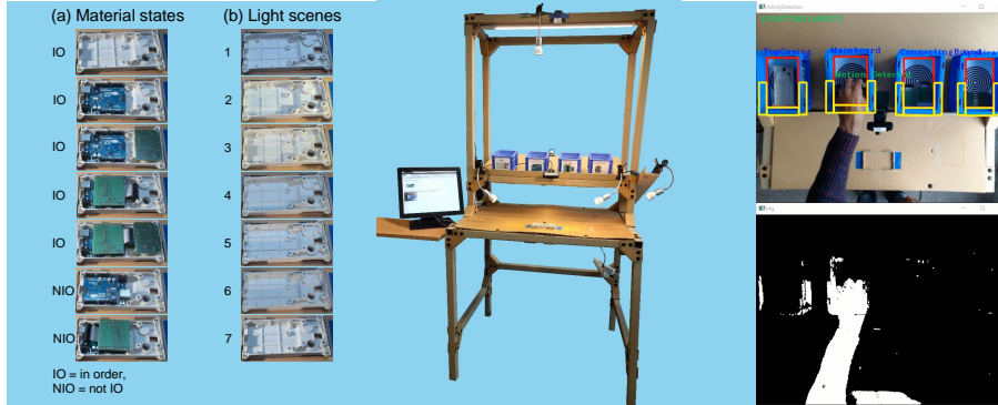
Fig. 2. Assembly workstation equipped with 1 touch screen, 2 cameras and 6 light sources (middle); example material states and 7 light scenes for one part (left); grasp detection using background subtraction with the 'U'-shaped activity zones (right).

orientations does not reflect expected ones, e.g. when WrongMaterial or WrongOrientation occurs. Then, a correction instruction is presented on the WGS.