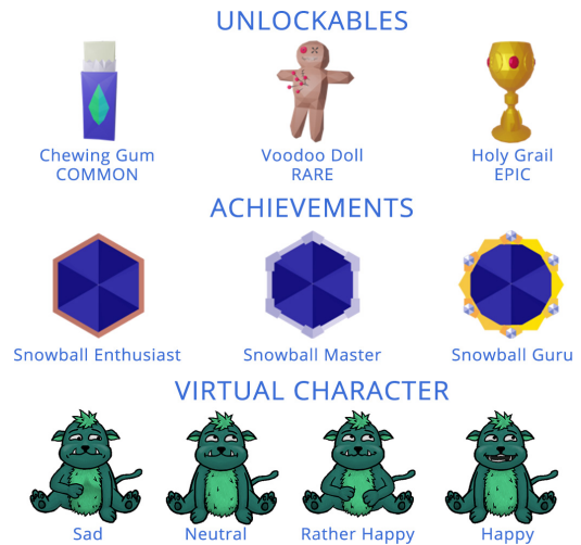
Figure 3: Visualizations of the score levels for Unlockables, Achievements and Virtual Character in Snowball Shooter.

is possible to use this input to predict Hexad user types. As such, Snowball Shooter provides some gamification elements that users can interact with (see Figure 1b): The user controls a snowball cannon and shoots snowballs at items representing each gamification element. These items are randomly positioned in each round. Shooting at an item increases the internal score of the corresponding gamification element. Similar to Cloud Clicker, the application consists of 15 rounds in which users may shoot five snowballs. It uses feedback sounds when shooting.