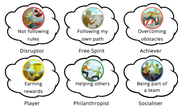
Figure 2: Illustrations and statements used in Cloud Clicker.

Similar to Triantoro et al. [45], we decided to transfer the 7-point Likert scales, which the Hexad questionnaire uses into binary choice questions in the gameful application. The whole design of the first gameful application (“Cloud Clicker”) followed the process proposed by Harms et al. [12, 14] and considered recommendations and lessons learned from relevant previous work [12, 13, 17, 45], as described in the following. In Cloud Clicker, users see two statements in each of 15 rounds and then have to decide which of these two statements is more relevant to them (see Figure 1a). We selected one statement for each Hexad user type, which grasps its underlying motivation. We based the statements on the definitions given by Tondello et al. [44] and on items with a substantial factor load in the confirmatory factor analysis in the validation study of the Hexad user types questionnaire [42]. This follows the same procedure as Triantoro et al. [45] proposed to translate the Big-5 survey into a gamified counterpart.