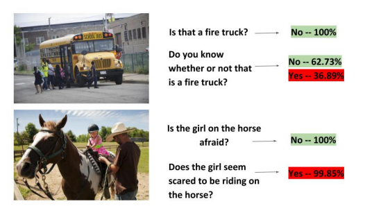
Figure 1: Example from VQA-Rephrasings dataset (Shah et al., 2019). The answers are obtained using Pythia (Jiang et al., 2018) where green text refers to correct answer and red text refers to wrong answer.

Visual Question Answering (VQA) (Antol et al., 2015) is an image conditioned question answering task which has gained immense popularity in vision & language community. Since the introduction of the VQA challenge<sup>2</sup>, there has been significant progress in the field of VQA, where new model architectures and training techniques are closing the gap between the model and oracle accuracy on benchmarking datasets like VQA2.0 (Goyal et al., 2017). A majority of models obtained higher gains