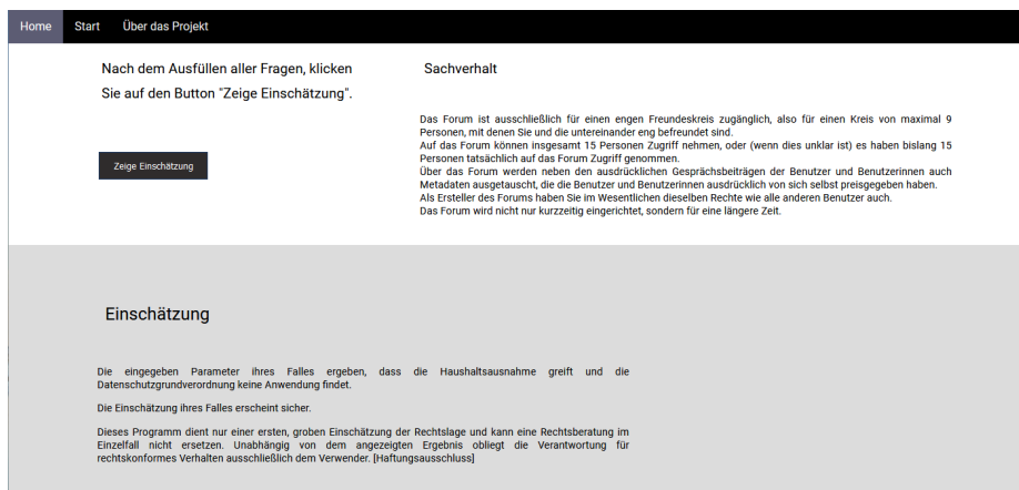
Fig. 2. Exemplary assessment of a submitted case.

is used for a retrieval on the case base. The retrieval result containing the most similar case is then returned to the web interface. The outcome of this retrieved case is displayed on the GUI (see Figure 2) and suggested to the user as the closest match to their query.