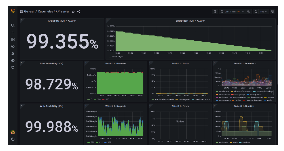
Fig. 3 Monitoring ELG using Prometheus and Grafana