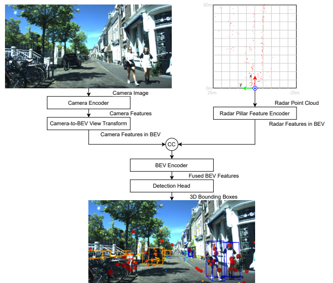
Fig. 1: Flowgraph of the presented radar-camera fusion in BEV, based on [5]. In the resulting camera image, we include projected radar detections and ground truth bounding boxes.

We follow the fusion architecture of [5]. An overview of our network for radar-camera fusion in BEV is provided in Figure 1. Note that the fusion occurs when the camera and radar features in BEV are concatenated. Below, we provide further detail for each block.