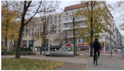
(a) RGB Image