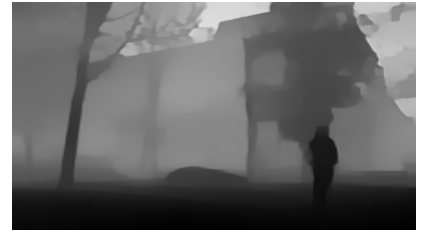
(c) Pixel-wise depth estimation using LeReS [6]