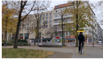
(b) Bicyclist detection using YOLOv7 [5]