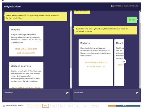
Figure 5: Evaluation of two presentation variants for a carousel widget

Figure 4: WidgetExplorer during comparison of different representations of a component