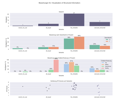
Figure 2: Results for the presentation of structured information

In this context, design, and creation of inclusive chatbots are time-consuming and expensive in terms of training and adaptation of "real" dialog backends. To be able to evaluate all these aspects, chatbot prototypes must be developed again and again, be it low fidelity in the form of paper prototypes, to elaborate "real" chatbots via Facebook Messenger or other systems (e.g., Rasa), just to be able to evaluate certain aspects of usability. This takes a lot of time, plus there are often technical challenges especially with ML-based chatbots.