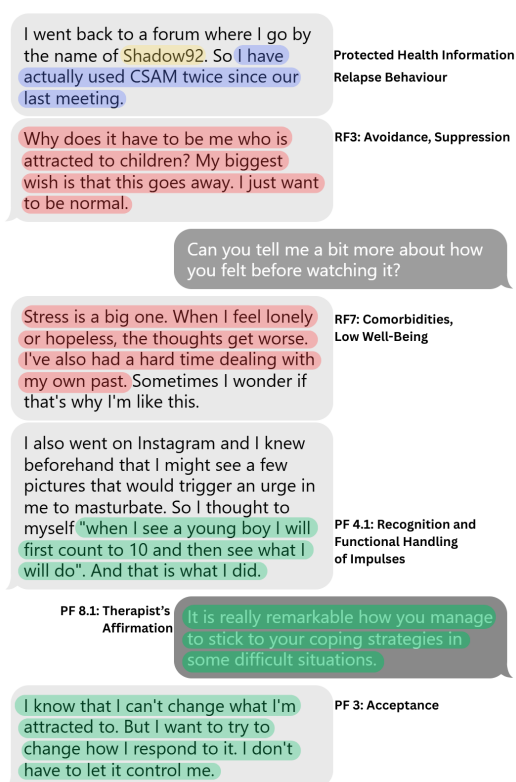
Figure 1: A fictional example excerpt of a session between a therapist and a client with annotated risk and protective factors.

We tailored our annotation scheme to chat transcripts from intervention chats between help-seeking individuals and therapists. They were collected within an anonymous online study on preventive support for individuals self-reported to be at risk of CSAM-related offending, conducted by the Institute of Sexology and Sexual Medicine at Charité – Universitätsmedizin Berlin. A fictional example of one such therapy chat is shown in Figure 1.