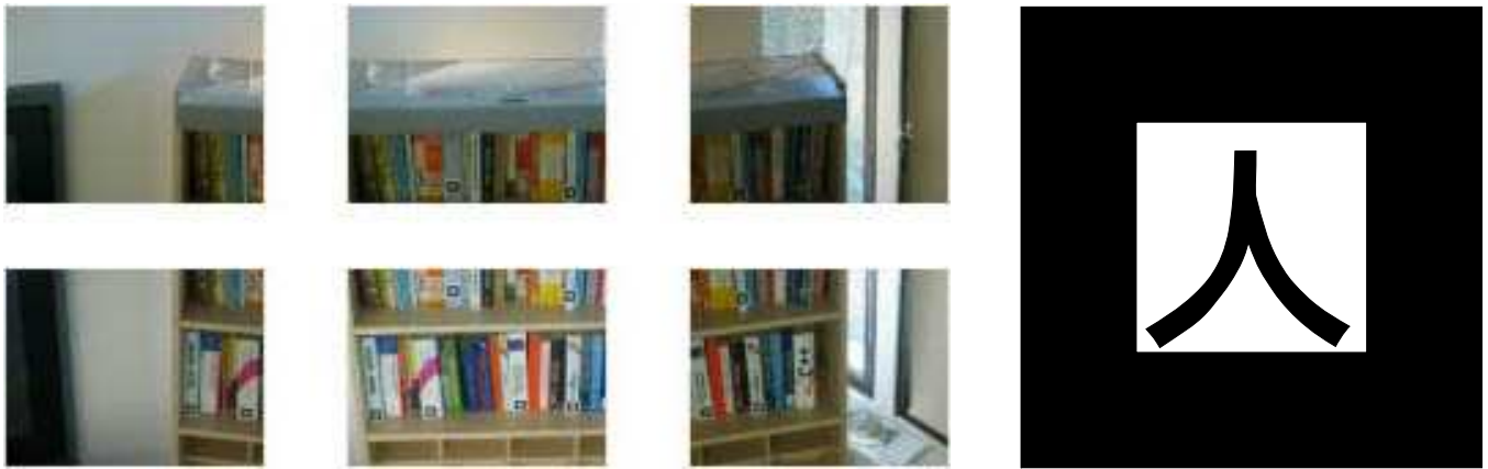
Figure 2: Images taken during the scanning process (left) and an example of an AR Toolkit marker (right)

patterns onto all surfaces in the room with line of sight to its position in the center of the ceiling. An attached camera can take high resolution pictures from (almost) the same position and scan them for objects and markers. It also provides a low resolution video stream in real time for the recognition of movements.