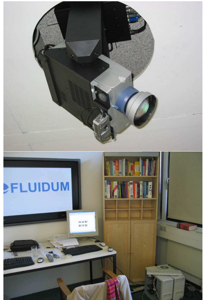
Figure 1: The steerable projector mounted on the ceiling (top) and one corner of SUPIE with a book shelf (bottom)

The Saarland University Pervasive Instrumented Environment (SUPIE) is an instrumented room with various types of displays, sensors, cameras, and other devices. By means of a steerable projector, the room has continuous display capabilities which are limited in resolution and temporal availability (only one area at a time). The various other displays provide islands of higher resolution and interactivity within this display continuum. The projector can project arbitrary light