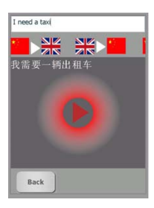
Figure 2: Free textual translation on mobile device

Furthermore, the transearly service is also useful for computational linguistic lectures because of big coverage of language pairs. Our current system supports more than 15 language pairs.