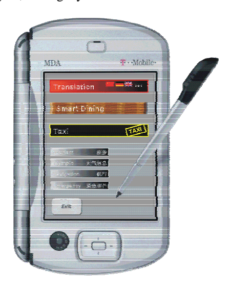
Figure 1: COMPASS Service Client

Smart dining and taxi talk combine multilingual generation with phrasebook translation. Resc you combines phrasebook translation with a free general text translation for selected situations. Transearly combines phrasebook translation with free text translation. We argue, why the respective demands and constraints of each of the four services are met by the selected combinations of approaches. All these services can be called by user requests and one service can call another service, for example, the smart dining service can access the transearly service too.