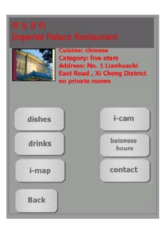
Figure 3: Navigation of restaurant information

In the current system, we have collected more than 300 dishes and 200 restaurants in Beijing. Dish, beverage and restaurant and location information is interlinked.