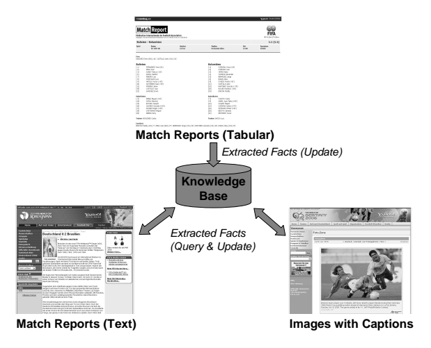
Figure 2: Semantic information integration

The Knowledge Base (KB) is at the heart of the transformation component, which not only updates facts into the KB, but also queries it to link newly extracted information from texts and image captions to already existing entities such as matches, players, etc. as illustrated in Figure 2. In the following section we discuss ontology-based information extraction from tabular reports, text and image captions in more detail, focusing on how the information from the different resources is integrated.