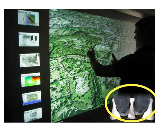
Figure 1: User is interacting with both hands and feet with a virtual globe using a large size multi-touch wall. User is standing on a Wii balance board (marked with yellow circle).

mouse input using the WIMP desktop metaphor. After experiencing the potential of multi-touch, users tended towards more advanced physical gestures [17] to solve spatial tasks, but these gestures often were single hand gestures or gestures, in which the non-dominant hand just sets a frame of reference that determines the navigation mode, while the dominant hand specifies the amount of movement. For example the tilt operation was mostly performed by pressing the non-dominant hand flat on the screen and by moving the dominant hand up and down to adjust the tilt angle. Motivated by these observations, we developed a method by which users can perform actions on a large-scale multi-touch wall with both hands and with their feet by shifting their weight over their feet on a Wii Balance Board [9].