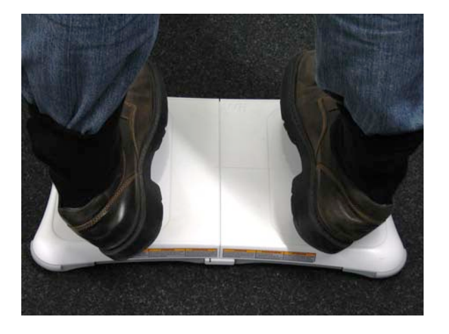
Figure 2: Foot waiting gesture. People waiting often standing on her sidefeets. This interaction can be used to return to the home screen.

with the feet (e.g. a "waiting gesture"; people waiting often standing on her sidefeet as can be seen in figure 2).