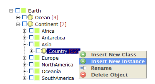
Figure 3: UbisEditor after right mouse button click

Based on this visualization technique, we implemented an extension of the ontology tree representation with additional editing functionalities. This online ontology editor (called UbisEditor) [Loskyll and Heckmann 2009] shall make an end-user friendly collective knowledge building possible. The editor already supports the most important functionalities for editing an ontology: creating new classes or instances, renaming and deleting objects. By using a context menu, we provide an efficient and easy-to-use way of performing these editor actions (Figure 3). With the help of UbisEditor our users could add new translations of location names, fix mistakes or add an instance of their residence, for example.