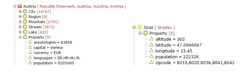
Figure 2: Left: Property nodes for Austria; Right: Property nodes for Graz

The properties of different locations are also integrated into the tree. For countries we show information like area, capital, currency, spoken languages and population (Figure 2 left), whereas cities can have properties like altitude, latitude, longitude, population, zip codes or dialing codes (Figure 2 right).