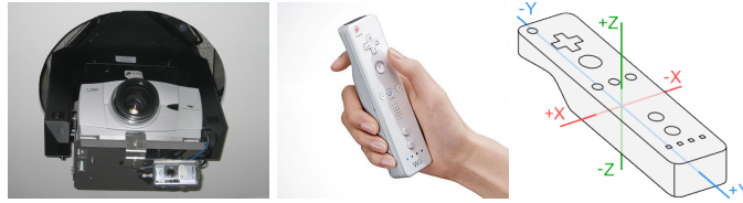
Fig. 1. Hardware setup: steerable projector and camera unit of the Fluid Beam system (left); Wii Remote interaction device (center); the three rotation axes of the Wii Remote (right)

Our approach of enabling interaction in the real world is based on gestures. One possibility to recognize hand gestures, beside computer vision techniques, is the use of acceleration sensors attached to the user's hand. Such sensors are integrated e.g. in instrumented gloves like the CyberGlove 3 or the WInspect Glove 4 . A popular alternative to capture acceleration data from the user's hand is offered by the recently released remote controlling device of the Nintendo Wii gaming console, the so-called Wii Remote (see fig. 1 center). Beside its motion sensing capabilities through the use of accelerometer technology, the Wii Remote provides further input modalities like buttons and an infrared camera. It is also capable of giving feedback to the user in the form of sound, vibration or flashing lights. Moreover, the Wii Remote is an affordable hardware that allows the development and testing of gesture-based interaction. The presented concepts can however be transferred to instrumented gloves like e.g. the WInspect Glove mentioned above.