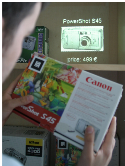
Fig. 4. Product Associated Display with price information.

A further possibility of integrating interactive projected displays in a shopping environment is offered by the so-called Product Associated Displays (PADs) [12] in conjunction with the Mobile Shopping Assistant (MSA) [13], which is running on a mobile device and offers multimodal input and output in order to assist customers in retrieving information about products of interest. One possible form of interaction with the MSA consists in a direct manipulation of the products in the shelf. If e.g. a product is taken out of the shelf, this action is recognized using an integrated RFID antenna and this event leads to the creation of a PAD projected at a location that is spatially linked to the interaction product, like e.g. the gap left by this product in the shelf. After that, the customer can use a variety of modalities like e.g. speech or written text in order to obtain information about the product he is holding in his hands. Figure 4 shows a customer interacting with a product (digital camera), retrieving price information on a PAD.