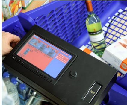
Fig. 2. SmartCart’s user interface.

try for the newly fetched product is moved to the end of the list and thus the products which still have to be found remain on top (see Fig. 2).