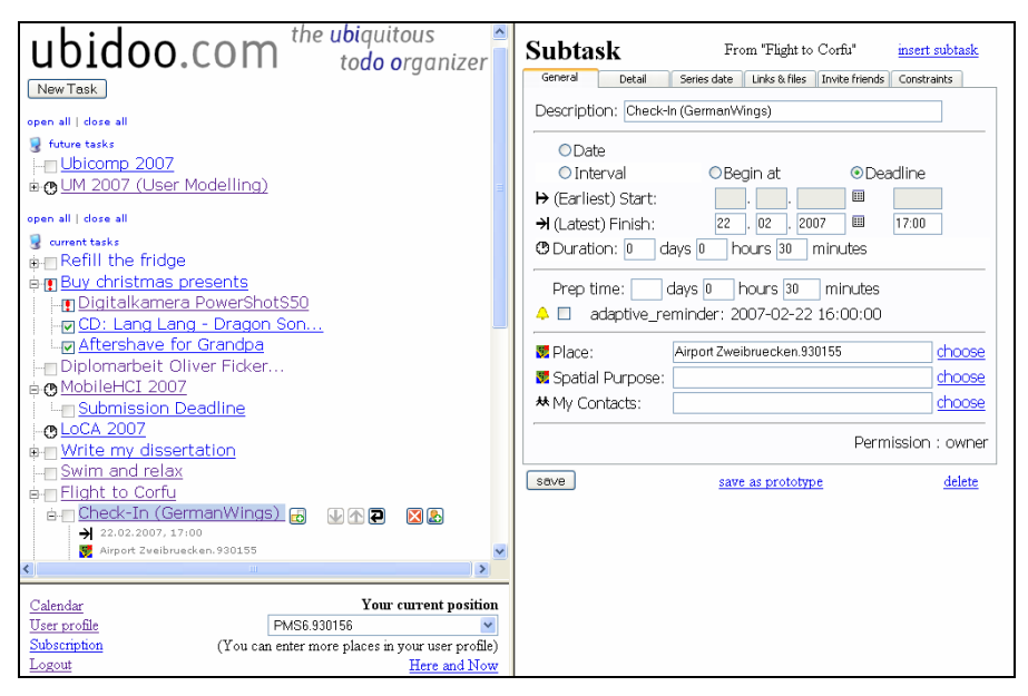
Figure 1: The Web-based user interface for the ubiquitous task planner Ubidoo.

The Ubidoo task planner is running on a Web-server<sup>2</sup> and can be accessed everywhere via the internet. The user interface for desktop PCs is split in three frames, as shown in Figure 1. On the left hand side, the users' tasks and subtasks are shown in a foldable tree structure. By selecting a task from the tree on the left, a summary of its details (dates, location and description) is shown and icons allow moving or deleting this task. In the frame to the right, various properties of the selected task can be edited which are arranged into six tabs. The bottom frame provides links to the user profile and a traditional calendar view. The user can also manually choose a location for an adapted task view ("here and now") that will be described later in more detail. For mobile devices, a reduced interface without frames and tabs is also available.