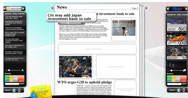
Figure 1: User interface

To realize this, we unify and merge the prepared content coming from the text management database system with the text briefs based on paid news feeds like those provided by Reuters, AFP or dpa. This operation is also done in the case of multimedia content provided by Magnum Photos, Corbis or Flickr via their respective APIs.