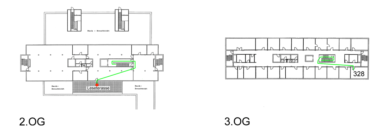
Figure 1: Map condition. Floor maps present a complete floor from an allocentric perspective. The route is indicated by a green line.