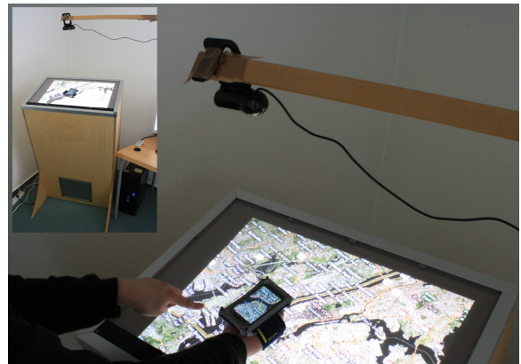
Figure 1: Multi-modal interaction with geographic data.

MUM '12, Dec 04-06 2012, Ulm, Germany Copyright 2012 ACM 978-1-4503-1815-0/12/12 ...$15.00.