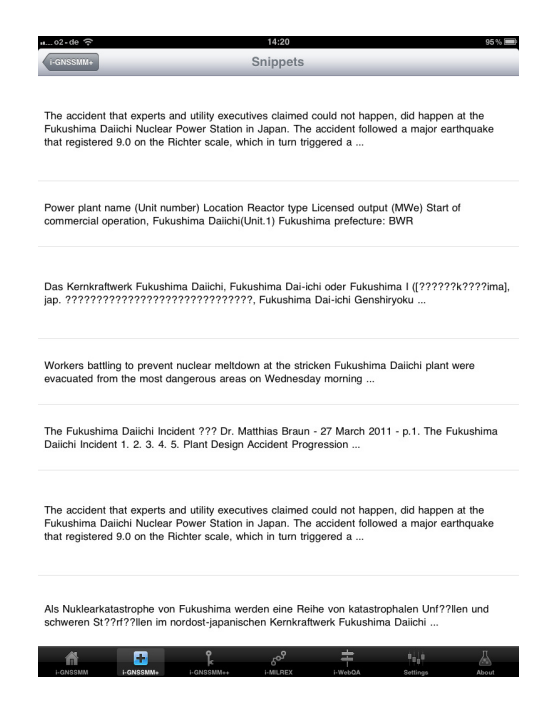
Fig. 3. The snippets that are associated with the node label "fukushima dai–ichi" of the topic graph from Fig. 2. A single touch on this snippet triggers a call to the iPad web browser in order to display the corresponding web page. In order to go back to the topic graph, the user simply touches the button labeled iGNSSMM on the left upper corner of the iPad screen.

Nevertheless, we want to benefit from PoS tagging during chunk recognition in order to be able to identify, on the fly, a shallow phrase structure in web snippets with minimal efforts. In order to tackle this dilemma, investigations into additional semantical—based filtering seems to be a plausible way to go.