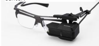
Brother Airscouter (HMD)