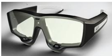
SMI Eye Tracking Glasses: The scene camera is located in the center.