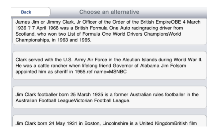
Fig. 2. The alternatives to choose from (part)