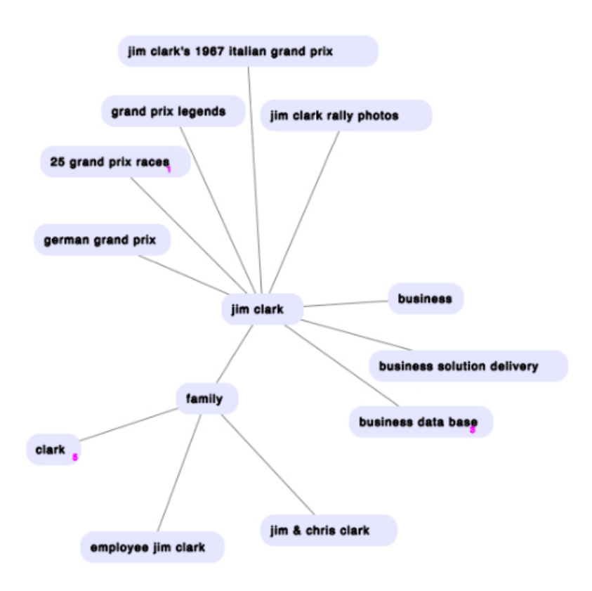
Fig. 1. The associated topics refer to three different entities.

entities or all of them, the topic graph will show associated topics that might lead the user into wrong directions while further exploring the search space (Fig. 1).