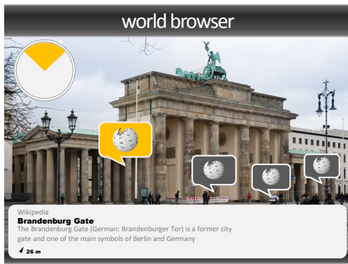
Figure 4: AR Labeling for world browsing. Exemplary application in the style of the Wikitude world browser

that case, the accuracy of standard GNSS such as Galileo (around 10m) could be sufficient for defining the coarse location).