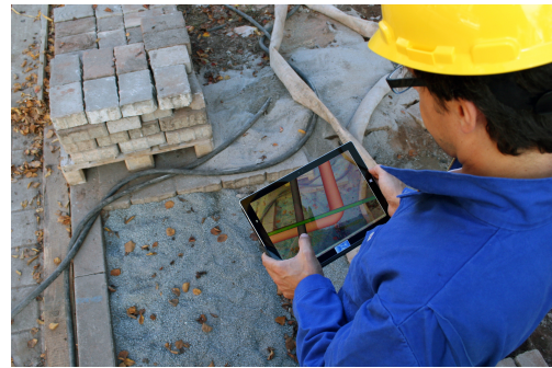
Figure 5: AR for utilities networks. Usage concept for the LARA system

it is therefore desirable to not rely on the camera as sensor for positional tracking.