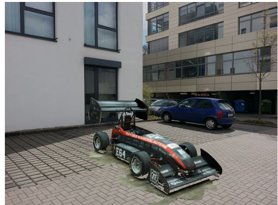
Figure 1: Example of AR application. Virtual car on a real parking lot

The remainder of this paper is organized as follows: after a short description of the main tasks of Augmented Reality, we present a