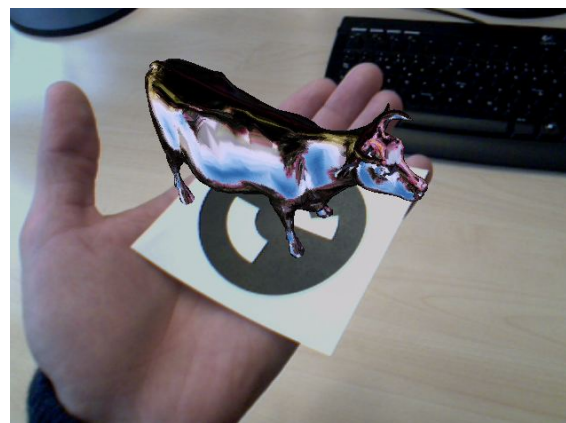
Figure 3: Example of a circular marker with augmentation

Because the aim of AR is to augment an image, the camera has been traditionally used as primary sensor for pose estimation in AR. The camera is usually used in an inside-out tracking approach. By using one or several cameras, model-based approaches can recognise specific objects given a known model, or compute the relative movement between two images up to a scale factor. In order to create useful augmentations, for example for annotating a building with emergency exits, main stairways etc., a model of the scene or object to track has to be known in advance. This can also be useful to handle occlusions. When the scene can be prepared using non-natural objects, specific markers can be used in the so-called marker-based pose estimation method. If the preparation is not possible and only objects naturally present in the scene can be used, the technique is called markerless pose estimation.