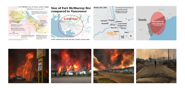
Figure 2: Most frequently shared images on Twitter for the event 'Wildfire Fort McMurray' in Canada. Top: Filtered images classified as synthetically generated. Bottom: Images classified as natural.

Images liked within tweets are analyzed with respect to the following aspects: Since user generated content is often very noisy [22], we first apply a image filtering to remove