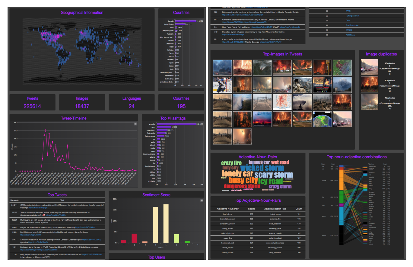
Figure 3: This visualizations shows two sections of our browser. Left: Geographical and temporal activities from social media as well as most influential tweets are visualized for the Wildfire in Fort McMurray are visualized. Left: Most popular images contained in tweets, together with the extracted Adjective-Noun Pairs and near duplicates are visualized. Bottom right shows all combinations of nouns and adjectives on all images

tered images from social media, we apply the concept classifier tool: DeepSentiBank [3]. DeepSentiBank is a fine-tuned Convolutional Neural Network (CNN), that is based on the Visual Sentiment Ontology (VSO) [2]. The VSO consists of 3244 Adjective-Noun-Pairs (ANPs), the classifier is trained on a subset of the VSO with 2089 ANPs. We apply DeepSentiBank on each image and select the top ten ANPs with the highest probability.