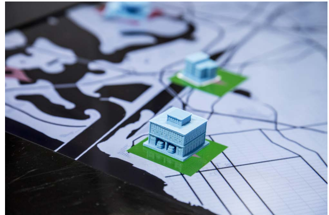
Figure 1: A Tangible User Interface utilizing 3D-printed tangibles arranged on a digital map.

information into a physical shape that allows the human brain to easily store and retrieve them is one of the key ideas behind Tangible User Interfaces (TUIs) [3]. This is very similar to the haptic feedback of mnemonic devices [1], which have been proven to be extremely helpful in generating working memory. TUIs built upon the human ability to grasp and manipulate physical objects and can have beneficial effects on the spatial memory, especially when being used for interacting with spatial data.