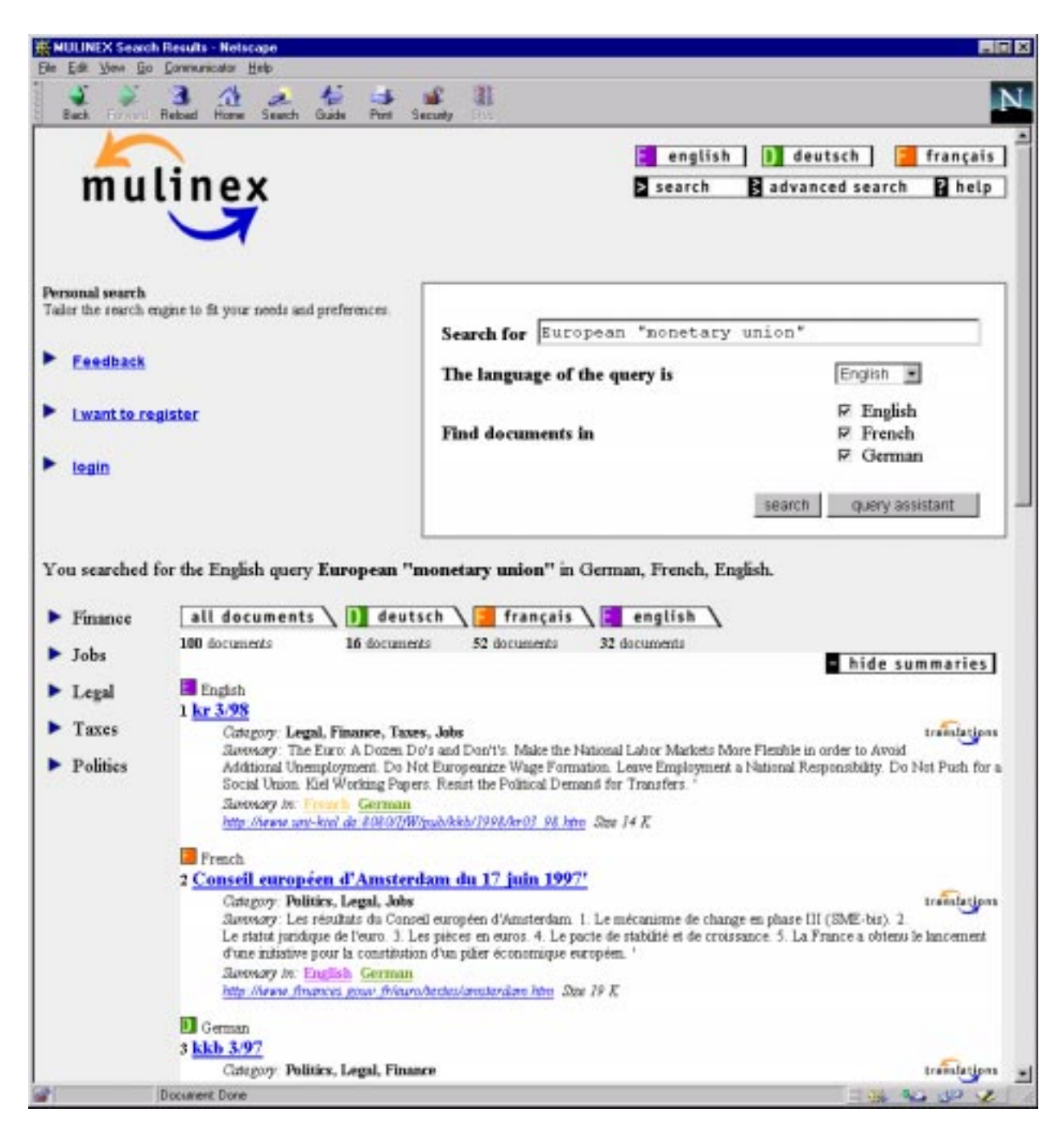
Figure 1: Query Form and Search Results Presentation

"query assistant" provides the opportunity for interactive disambiguation of the query translations (see figure 1 for the translations and expansions of the query term fair ). In order to help users who do not understand the target language with the disambiguation of query translations, the "query assistant" shows how each translated query term translates back into the original query language. As the example for the query term fair in figure 2 shows, the back translations assist the user in eliminating translations into German and French which are irrelevant to the intended meaning<sup>4</sup> even though the user may not have any knowledge of German and French. The precision of the German and French queries is thus improved.